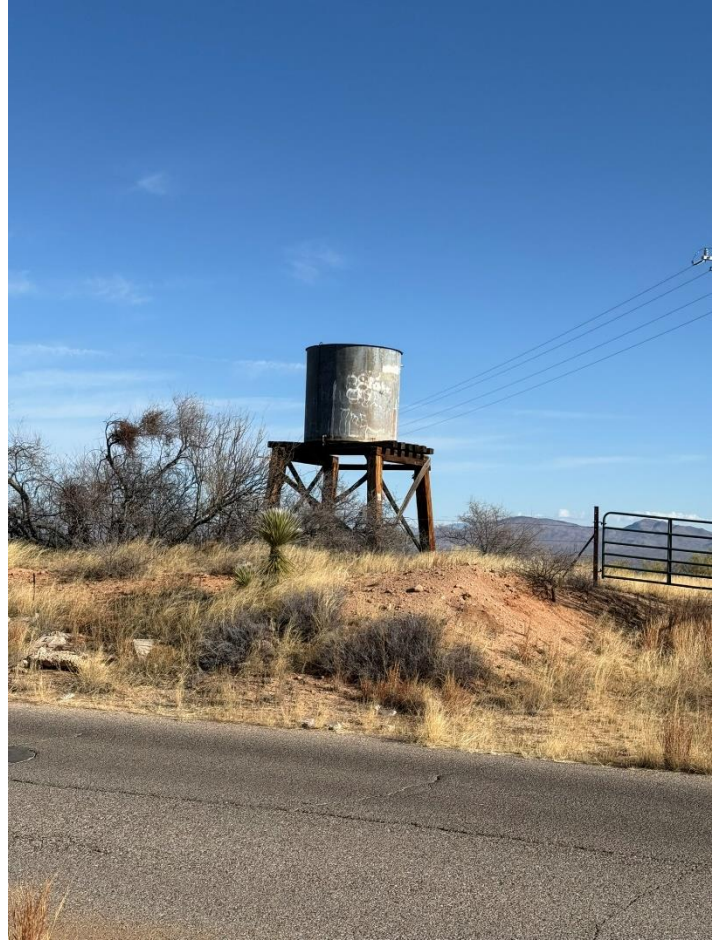
This, and following photos are from a gravel ride on 2/11/25 in Arizonia