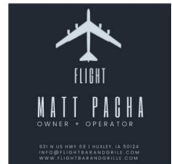
Flight Bar and Grill