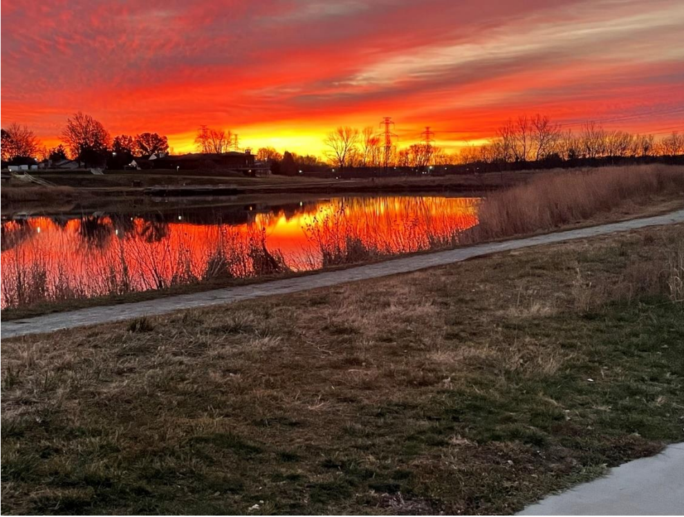
From the bike trail at Terra Park, Johnston, just before sunrise.