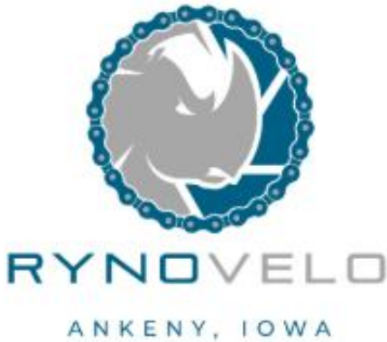
Rynovelo Bike Shop