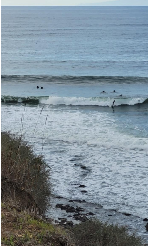
From a member spending winter in Southern California for biking and ocean Swimming (at 57 degrees)